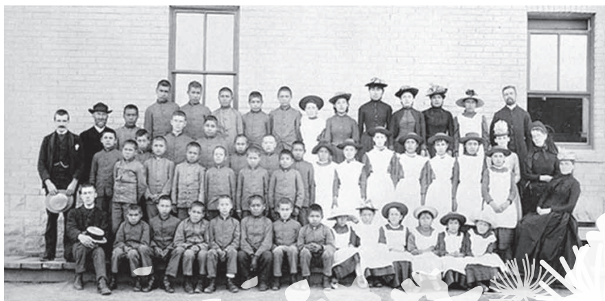
“Portrait of Native students at St. Paul’s Indian Industrial School.”

This fact sheet is the first of three that will focus on anti-Indigenous racism in Canada, 2 beginning with an exploration of the concept of race, its history and contexts, and continuing with a discussion of the various forms of racism within societies. In order to address racism in Canadian society, we must first understand what racism is, how it became a way to identify people, and the forms it takes.